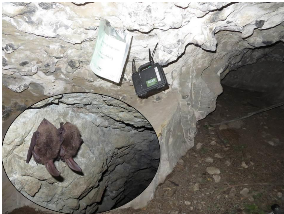
Townsend's Big-eared Bats hibernating in tandem!