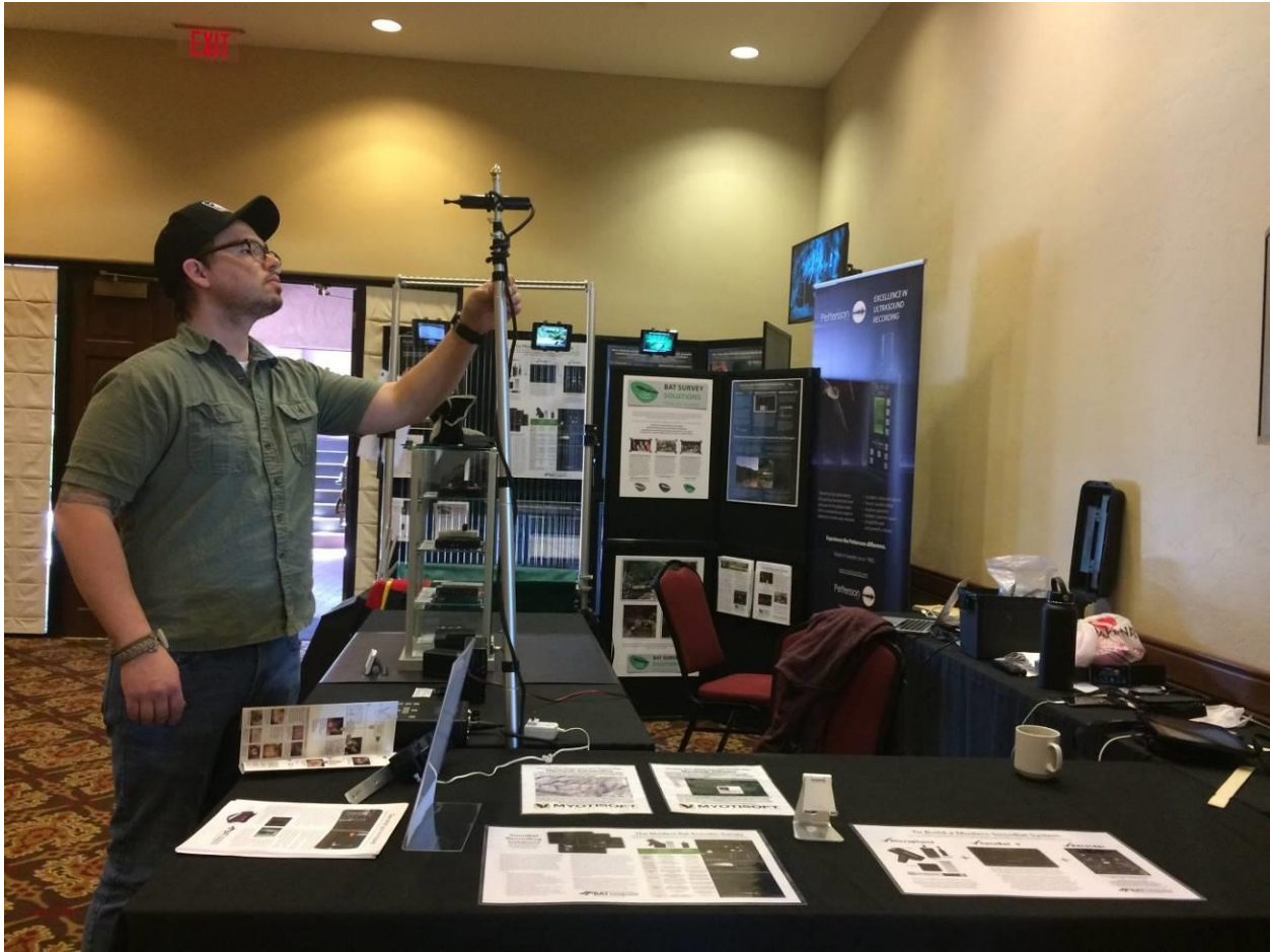
Sonobat and Petterson detectors were show-cased at this extravagant display booth by Bat Conservation and Management. Sonobat 4 is available now for sale on sonobat.com website, and a new version that contains regions for Alberta and BC is expected out this spring.

New echolocation kids on the block this spring that were showcased :