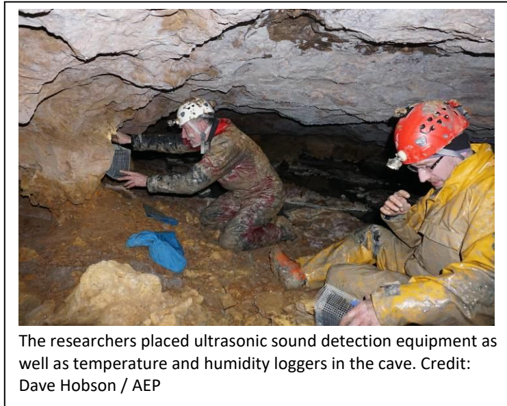
The researchers placed ultrasonic sound detection equipment as well as temperature and humidity loggers in the cave.

Cadomin Cave was extensively surveyed this year including the lower portion which was last surveyed in the winter of 1999-2000. One hundred and ninety-six bats were counted, up from 112 during the 1999/2000 survey. We placed roostloggers and temperature/humidity loggers in the lower levels. The main galleries of Cadomin Cave were also surveyed in March. The count of 1489 was a bit lower than the last 3 counts but still above the last 10 year average. We had moved the survey from January/February to March this year to improve our chance of observing WNS if it was here already. Thankfully, there was no sign of WNS.