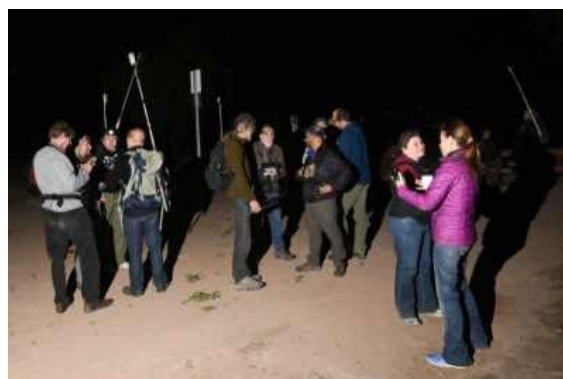
An evening at the Echolocation Symposium.

http://www.batsurveysolutions.com/Events/2017acousticsymp.html