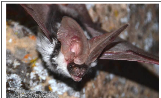
A gorgeous Spotted Bat.

in full spectrum, without realizing that the format that you record in has dramatic ramifications for how you deploy your detector, and how you analyze your files. And finally, even simple things like which detector settings (especially in full spectrum) and microphones (frequency response, directionality, signal to noise ratio) are used, can affect your downstream analyses. My take home message in this newsletter article is really this: if you plan to do acoustic monitoring of bats and are new to bat acoustics, I highly recommend you obtain some training before you pull the detectors out of the box and head to the field!