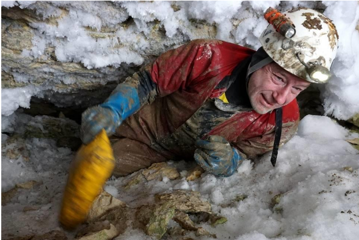
Access to the cave is extremely tight and it proved challenging to explore its narrow passages.