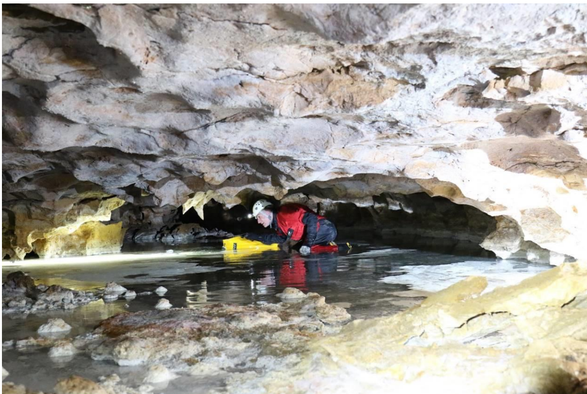
Crawling through the sulphuric waters in the cave required dry suits and care to protect eyes and mouths.

Perhaps the most interesting find was the cave temperature. All other known hibernacula in Alberta have year-round temperatures of around +2 or +3°C. This cave, as measured with a laser temperature reader, had temperatures of around +10°C on the rocks close to one of the larger bat clusters.