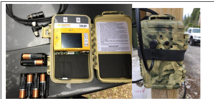
Titlely Scientific's first combined full spectrum and zero-cross passive detector: Anabat Swift

New echolocation kids on the block this spring that were showcased :