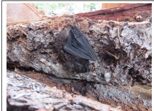
The BC CBP received numerous reports of bats overwintering in firewood piles (like this Silver-haired Bat), and behind window trim.

Summary: White-Nose Syndrome is an emerging fungal disease that results in high mortality of susceptible bat species. It has not yet been detected in British Columbia (BC) but is expected in the near future. To monitor the spread of the disease, identify species-specific impacts, and track recovery of affected species, we need a statistically-robust program for monitoring bat populations. The BC Annual Bat Count offers good potential for population monitoring trends in species of bats such as the federally-endangered Little Brown Myotis ( Myotis lucifugus ) that use human structures for roosting.