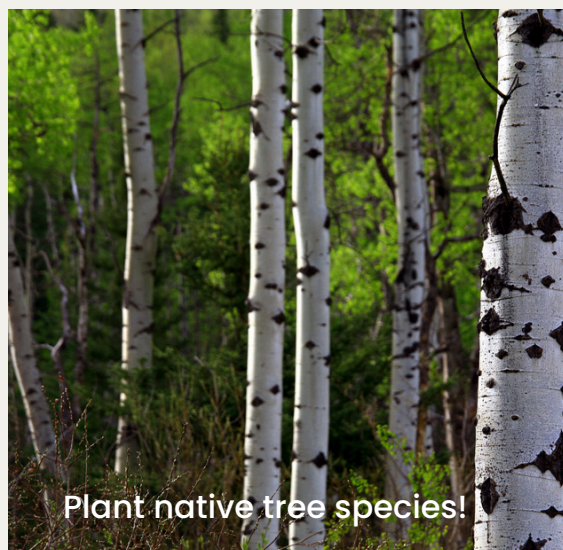
Plant native tree species!