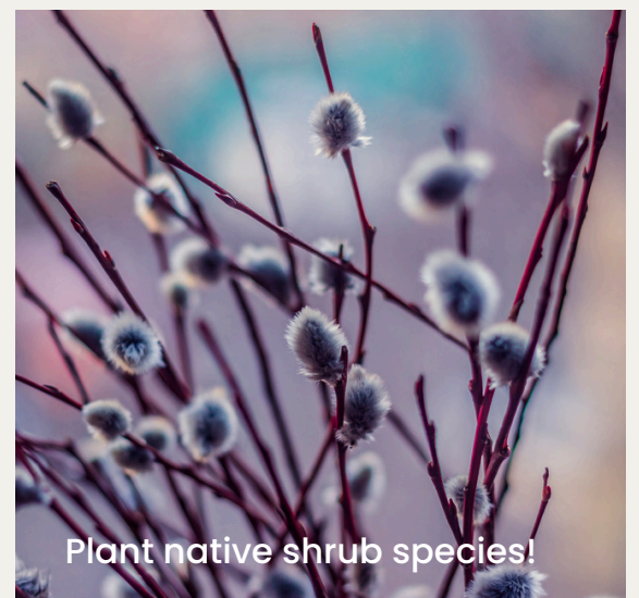
Plant native shrub species!