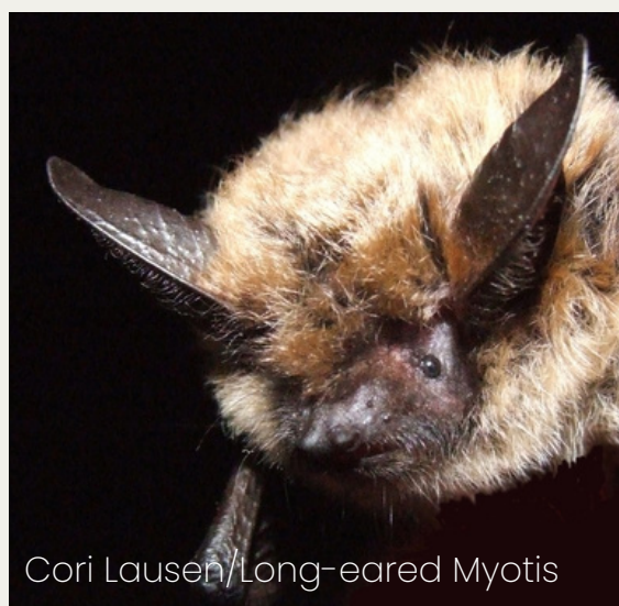
Cori Lausen/Long-eared Myotis