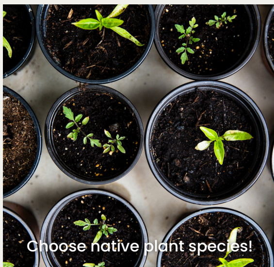
Choose native plant species!