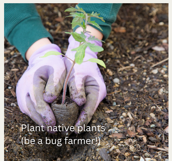
Plant native plants (be a bug farmer!)