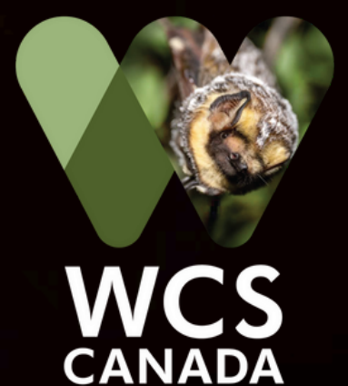
Little Brown Myotis – endangered as a result of white-nose syndrome.