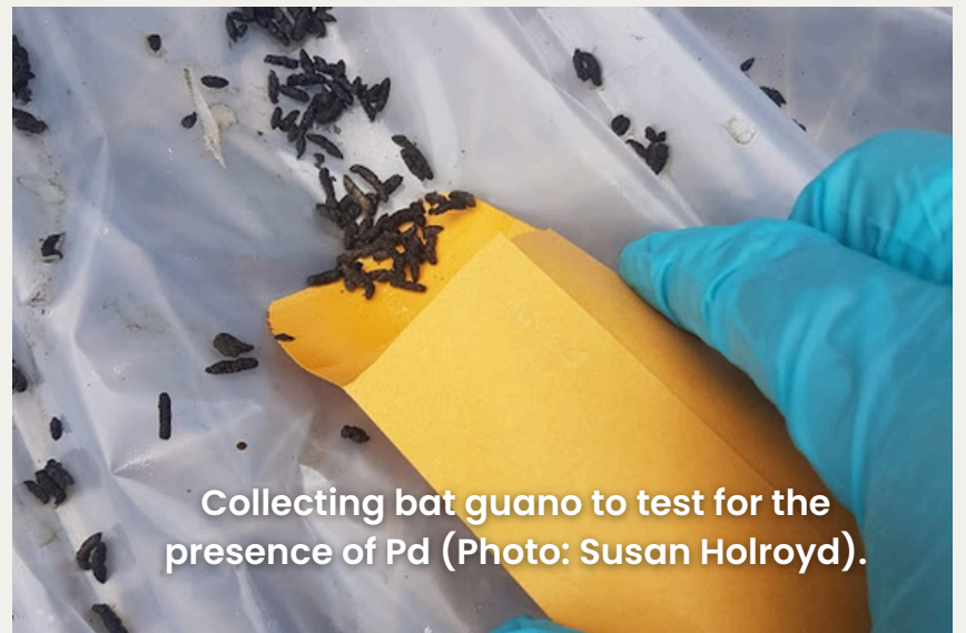
Collecting bat guano to test for the presence of Pd.